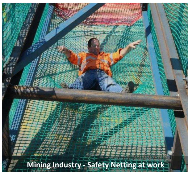
Mining Industry - Safety Netting at work

Safety Netting provides the necessary personal protection against injury or death from falls, as well as the protection for others from falling equipment and debris.