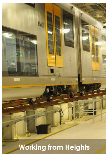
Working from Heights

OXLEY NETS can provide a solution to the 'Working from Heights' Risk associated with train carriage and locomotive doors being open during periods of workshop maintenance or cleaning.