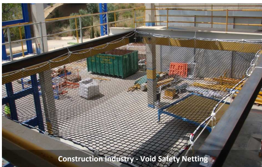
Construction Industry - Void Safety Netting

OXLEY NETS can provide a range of solutions to your specific need for Safety Netting. Utilised in Construction, Industrial & Mining applications, these Nets all conform to the European Standard EN 1263-1 – the default international standard.