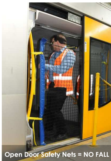
Open Door Safety Nets = NO FALL