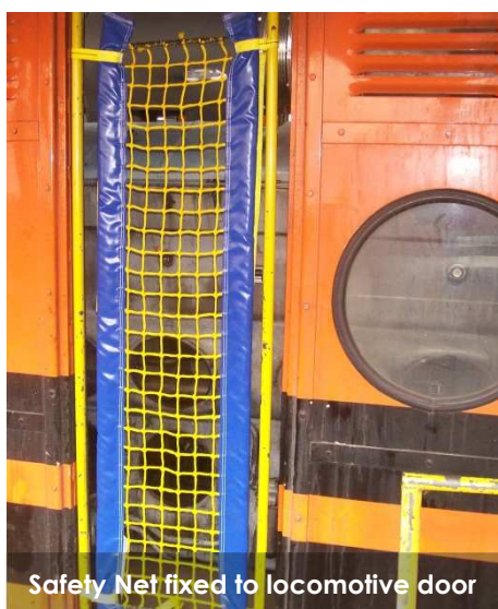
Safety Net fixed to locomotive door

Open Door Safety Nets provide the necessary personal protection against injury or death from falls, by barricading the door opening, and eliminating the possibility of falling to the workshop floor.